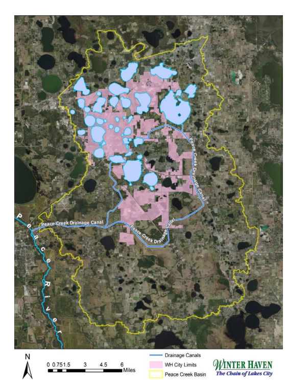
PEACE RIVER WATERSHED AREA